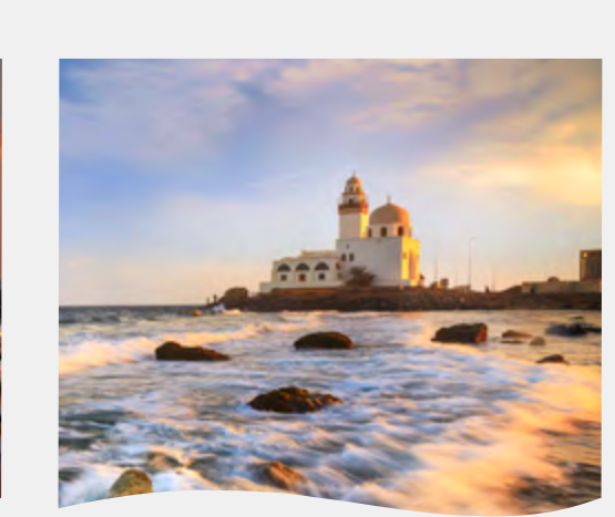
Jeddah 28 weekly flights