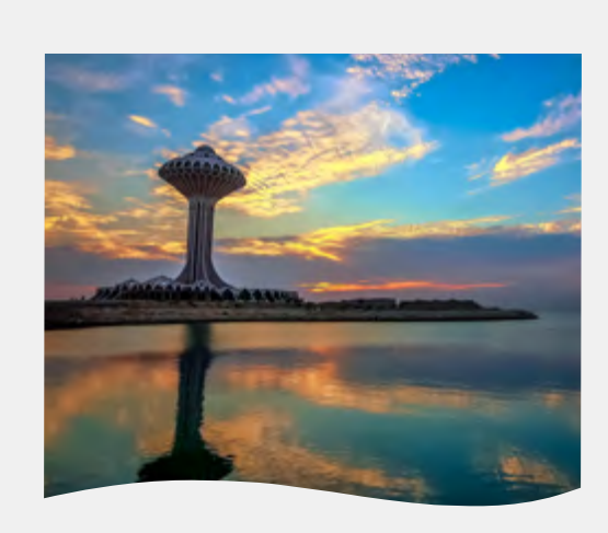
Dammam 35 weekly flights