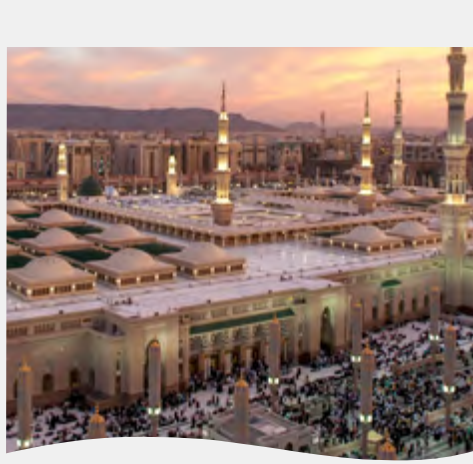
Medina 14 weekly flights