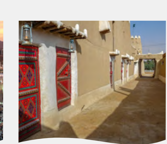
Gassim Three weekly flights