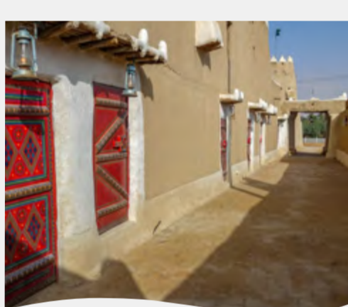
Gassim Three weekly flights