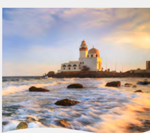
Jeddah 28 weekly flights