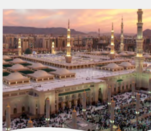
Medina 14 weekly flights